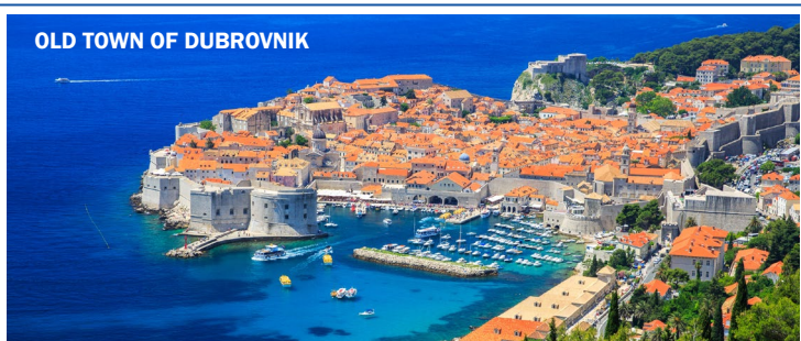
OLD TOWN OF DUBROVNIK

Dubrovnik Extension: $1,199 Double Occupancy or $1,898 Single